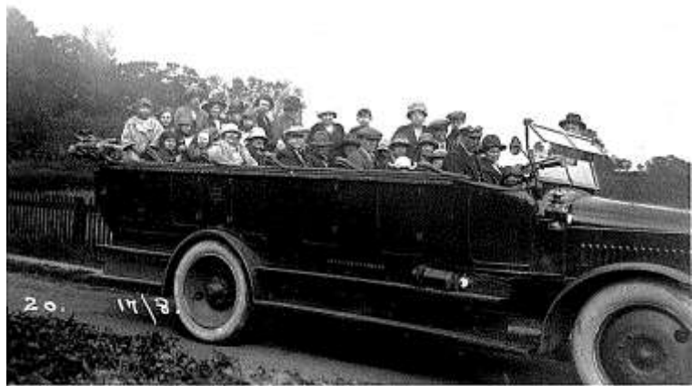
Postcard showing charabanc bus trip and passengers circa 1910-1920