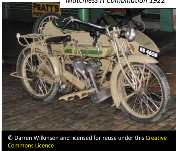
Matchless H Combination 1922