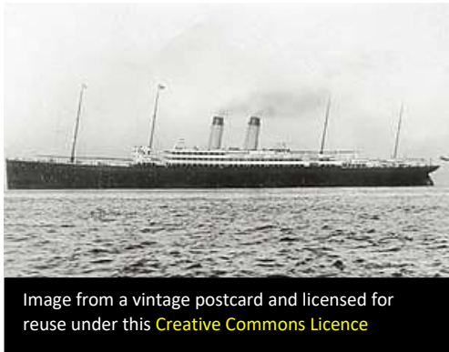
Image from a vintage postcard and licensed for reuse under this Creative Commons Licence